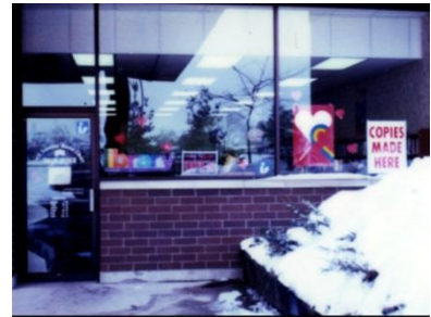
NSLD/Roscoe's original location.

In 1987, NSLD took out a mortgage to support an addition of nearly 19,000 square feet for the NSLD/Loves Park library, making room for an auditorium, meeting rooms, display cases, and additional space for staff and books. The original section of the building was also renovated.