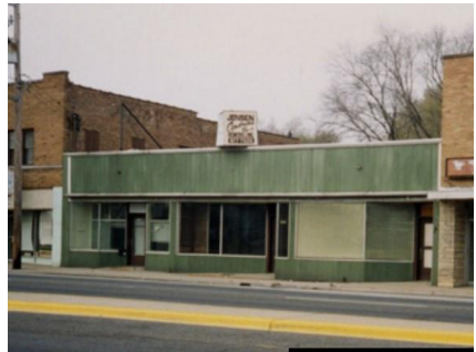
North Suburban Library District's first location on 5426 N. Second Street.