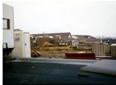
Construction begins on NSLD/Roscoe's new location at 5562 Clayton Circle.

Eleven years after Roscoe Township was annexed to the Library District, voters approved a $5.3 million bond to build a new library in Roscoe and increase the size of the NSLD/Loves Park facility. A new NSLD/Roscoe library and a remodeled NSLD/Loves Park library opened in the fall of 1997. The NSLD/Roscoe library totaled 16,000 square feet, while the NSLD/Loves Park library building now totaled 54,000 square feet.