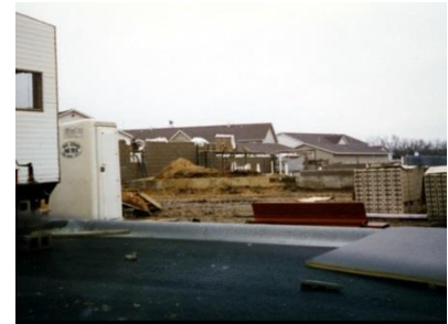
Construction begins on NSLD/Roscoe's new location at 5562 Clayton Circle.

Eleven years after Roscoe Township was annexed to the Library District, voters approved a $5.3 million bond to build a new library in Roscoe and increase the size of the NSLD/Loves Park facility. A new NSLD/Roscoe library and a remodeled NSLD/Loves Park library opened in the fall of 1997. The NSLD/Roscoe library totaled 16,000 square feet, while the NSLD/Loves Park library building now totaled 54,000 square feet.