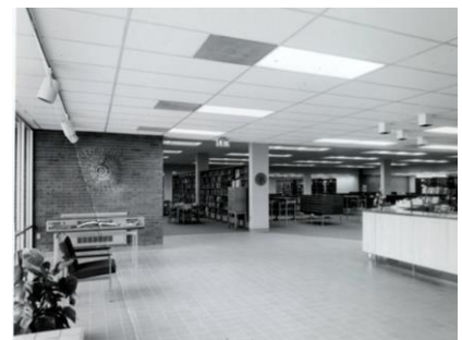
North Suburban Library District's opens at 6340 N. Second Street.

By 1960, the circulation had grown to more than 150,000 and the library needed to expand again so the library leased the building at 535 Loves Park Drive. By 1968, space became such a serious problem that the Board of Trustees decided to construct a building on land previously purchased at 6340 North Second Street. In 1969, the new library opened.