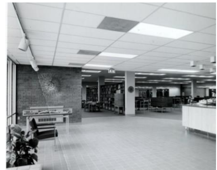
North Suburban Library District's opens at 6340 N. Second Street.

By 1960, circulation had grown to more than 150,000, requiring further expansion, so the library leased the building at 535 Loves Park Drive. By 1968, space became such a serious problem that the Board of Trustees decided to construct a building on land previously purchased at 6340 North Second Street. In 1969, the new library opened.