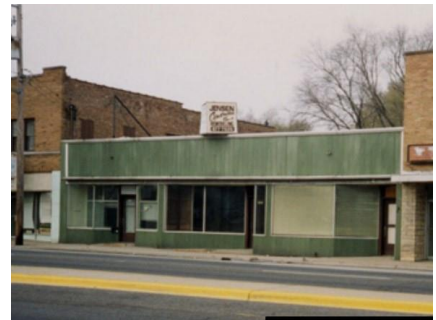
North Suburban Library District's first location on 5426 N. Second Street.